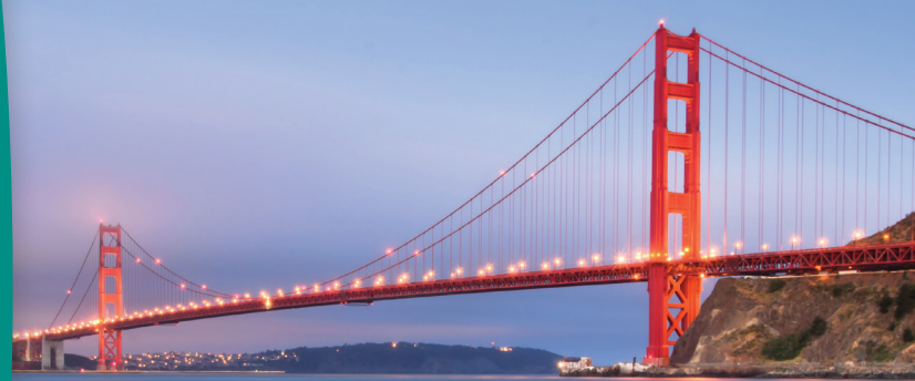
Golden Gate Bridge, California