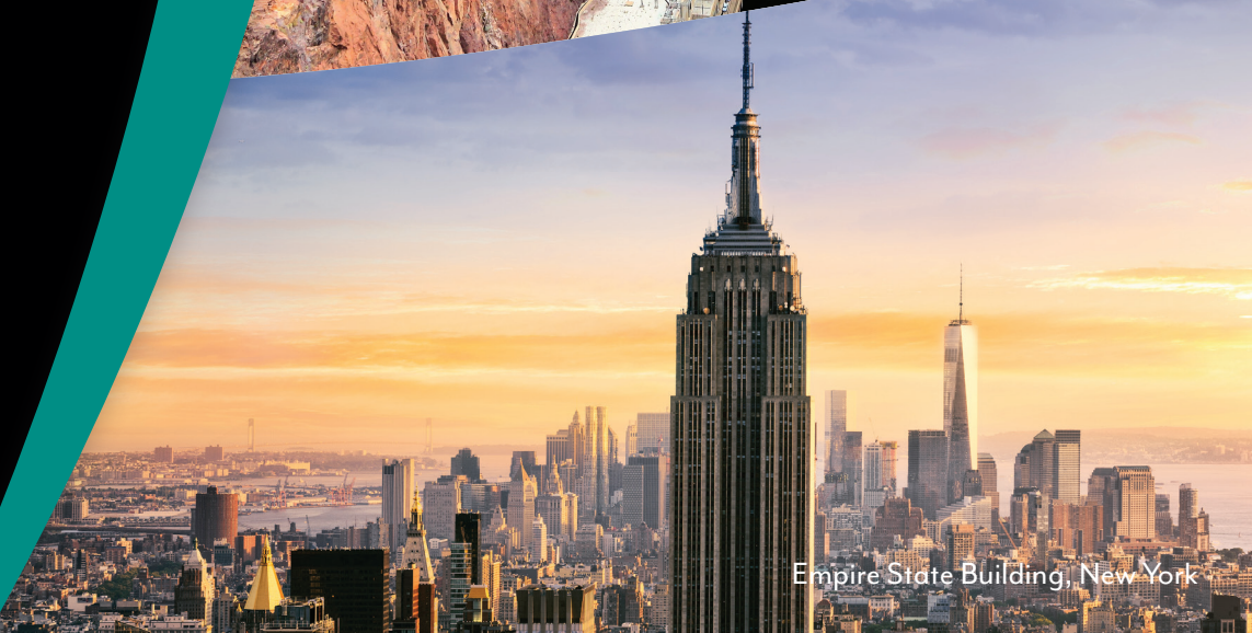
Empire State Building, New York