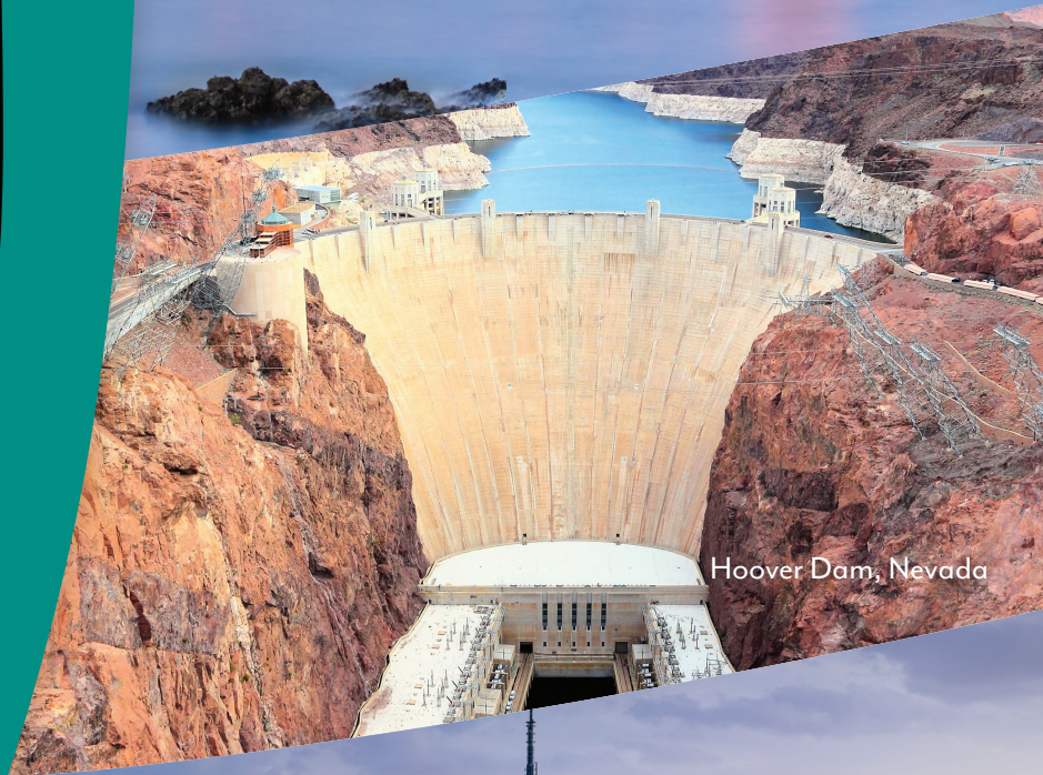
Hoover Dam, Nevada